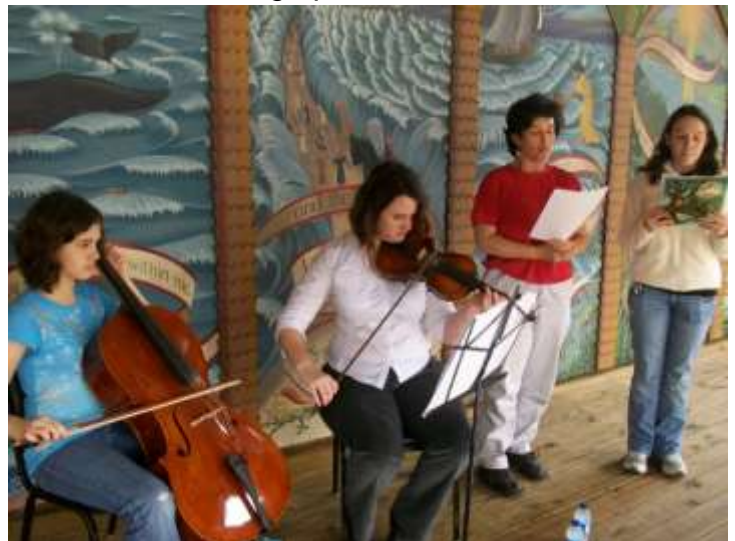
Christmas Music and gifts - students from Benjamin Franklin High School

In January of 2010 our long time sandwich makers retired. Every Monday and Wednesday they would come to Lantern Light in the early morning and make hundreds of sandwiches. When we arrived at 7:15 am they would be finishing up.